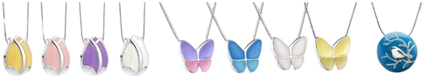
TULIP AUNL1072 AUNL1075 AUNL1076 AUNL1077 * WINGS OF HOPE AUNL1200 AUNL1201 AUNL1202 AUNL1203 BLESSING BIRDS AUNL1271

Leaning Heart Silver $388 Leaning Heart Gold $429 Leaning Heart Rose Gold $476