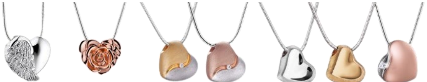
LOVE WINGS AUNL1004 LOVEROSE AUNL1550 * HEARTFELT AUNL1050 AUNL1051 LEANING HEART AUNL1000 AUNL1001 AUNL1530

Plain Cross $347 Yin Yang $476 Rainbow $476 Tree of Love $512