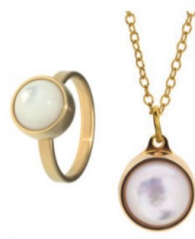
AUNB-RG-MOP Mother of Pearl Ring Gold AUNB-PG-MOP Mother of Pearl Pendant Gold