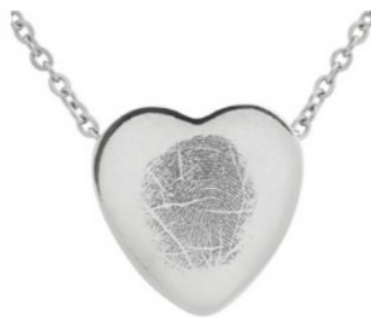
Plain Silver Heart ◇ AUNP8384