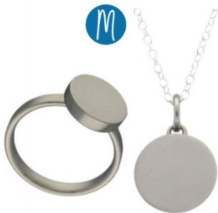
AUNB-RS-PRI Plain Circle Engravable Ring Steel