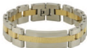
Cable Link Pewter AUNT5200