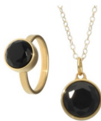
AUNB-RG-ONB-FC Black Onyx Faceted Ring Gold AUNB-PG-ONB-FC Black Onyx Faceted Pendant Gold