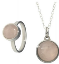
AUNB-RS-ROQ Rose Quartz Ring Steel AUNB-PS-ROQ Rose Quartz Pendant Steel