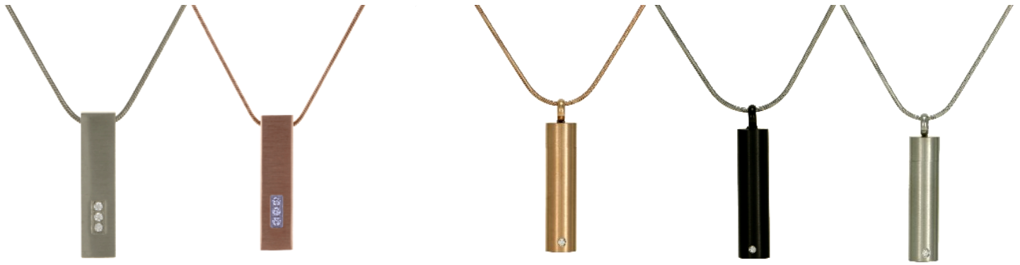
Pillar Pewter AUNT5091 Pillar Rose AUNT5092 Cylinder Rose AUNT5082 Cylinder Onyx AUNT5083 Cylinder Pewter AUNT5081

Pillar Pewter, Rose $173 Hourglass Pewter $160 Plain Cylinder Blue, Onyx, Pewter $127 Hourglass Rose, Onyx $169 Cylinder Rose, Onyx, Pewter $165