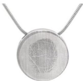
Plain Pewter Circle ◇ AUNT8031