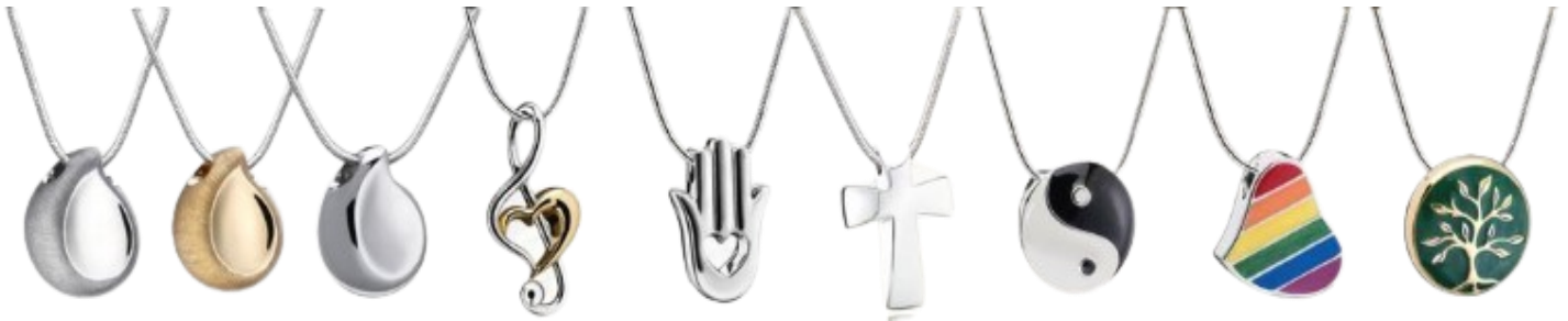
K TEARDROP AUNL1020 TREBLE CLEF HEART AUNL1250 HAMSA HAND AUNL1380 PLAIN CROSS AUNL1090 YIN YANG AUNL1310 * RAINBOW AUNL1003 TREE OF LOVE AUNL1470

Teardrop Silver-Two Tone $429 Teardrop Gold-Two Tone $461 Teardrop Silver $429 Treble Clef Heart $429 Hamsa Hand $347