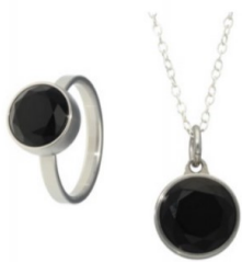
AUNB-RS-ONB-FC Black Onyx Faceted Ring Steel AUNB-PS-ONB-FC Black Onyx Faceted Pendant Steel

Mother of Pearl Ring Gold $449 Mother of Pearl Pendant Gold $569