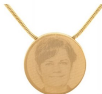
Plain Bronze Circle ◇ AUNT8030