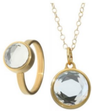
AUNB-RG-CRY-FC Crystal Faceted Ring Gold AUNB-PG-CRY-FC Crystal Faceted Pendant Gold