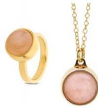
AUNB-RG-ROQ Rose Quartz Ring Gold AUNB-PG-ROQ Rose Quartz Pendant Gold

Crystal Faceted Ring Gold $449 Crystal Faceted Pendant Gold $469