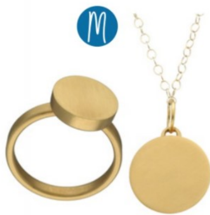
AUNB-RG-PRI Plain Circle Engravable Ring Gold

Steel Ring $374.00 Steel Pendant $465.00