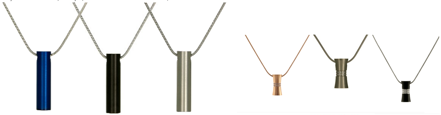
Plain Cylinder Blue AUNT8003 Plain Cylinder Onyx AUNT8002 Plain Cylinder Pewter AUNT8001 Hourglass Rose AUNT5102 Hourglass Pewter AUNT5101 Hourglass Onyx AUNT5103

Pillar Pewter, Rose $173 Hourglass Pewter $160 Plain Cylinder Blue, Onyx, Pewter $127 Hourglass Rose, Onyx $169 Cylinder Rose, Onyx, Pewter $165