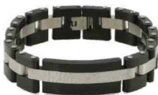
Cable Link Onyx AUNT5201